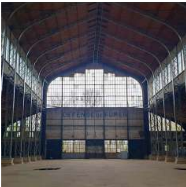
Current view of the Hangar Y, before the transformation work