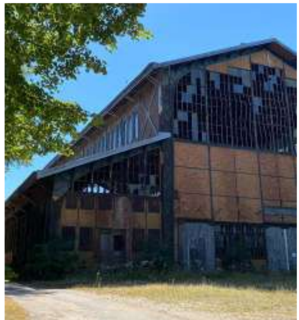
Current view of the Hangar Y, before the transformation work