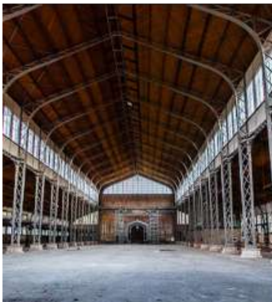
Current view of the Hangar Y, before the transformation work

By choosing to give priority to the art schools graduates of 2020 and 2021 for this residency, Art Explora and Artagon wish to support a generation of young European artists who have been particularly affected by the health crisis, as they did not benefit from the same professional opportunities as the others after their graduation, and started their artistic activity in a particularly difficult context.